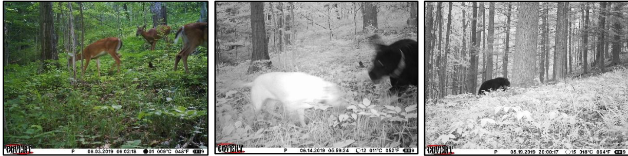
Figure 9. Examples of animals (deer, dogs, and a bear) captured on game cameras that visited large yellow lady's-slipper populations during the course of this study.

Poaching is often cited as a reason for the global decline of orchids and based on our survey results, was thought to be a threat in Pennsylvania as well (Table 7). However, no evidence of poaching was noted in the 14 populations visited for this study (Table 8). Our game cameras only captured visitation by people who were working on the project. The low intensity populations were only visited once during the growing season (although site visits were when larger stems were flowering and highly visible) so it may have been possible that poaching occurred later in the season. Harvest pressures may be less for this species given that nursery stock is readily available online, but small-scale harvesting for personal collection is probably still a valid threat. Additional monitoring of easily accessible populations might shed more light on quantifying harvest pressures for this species.