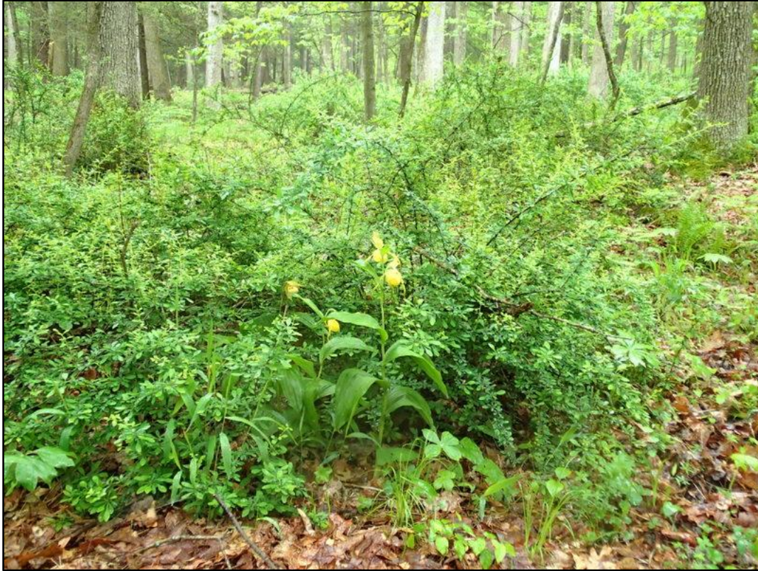
Figure 6. An example of a population of yellow lady's-slipper being invaded by Japanese barberry.

Insect damage was the second most common threat noted in the populations visited. Nine of the 14 populations (64%) had some level of foliar or floral insect damage (Table 8; Figure 7). However, insect damage was usually limited to just a few stems in the population. We did note occasional insect damage to the flower pouch, but it is unknown if this impacts pollination success and subsequent successful capsule development. Based on the two sites where we did more intensive demographic work over two years, we did not see discriminative insect damage (the same stems were not damaged year after year). It is likely that insect damage may be more of a random event and although it results in damage to individual stems, the damage is likely not a strong contributor to overall population decline.