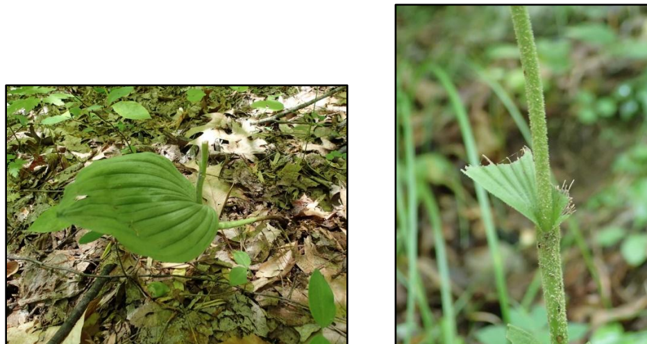
Figure 8. Examples of deer browse damage to the stems and leaves of yellow lady's-slippers.

Deer browse was reported at seven of the 14 populations (50%) (Table 9). Similar to insect damage, browsing was usually limited to a few stems in each population and resulted in variable damage to the plant (Table 9). Damage noted ranged from a single browsed leaf to browsing of almost the entire plant (Figure 8).