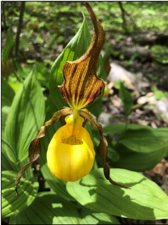
Figure 3. A close-up of the flower of a large yellow lady's-slipper.

thus potentially trapping the insect for seconds to days (Mergen 2006). If the insect is the appropriate size, it will find two exits in the back of the pouch. To exit, the insect must crawl beneath and press up against the stigma. This action causes the exit holes to widen, where the sticky, viscid pollen masses are conveniently located to brush against the insect (Deller 2005). A successful pollination event occurs when an insect correctly navigates two separate flowers (Nilsson 1979, Case and Bradford 2009). If successful pollination occurs, a capsule will form that contains dust-like seeds, with estimates of 7,000 seeds per capsule (Light and MacConaill 1998). The capsules remain upright in the winter and it is likely that seeds are wind dispersed (Mergen 2006, Arditti and Ghani 2000). Although each capsule contains thousands of seeds, seed set is low, and overall propagation of the species is assumed to be mostly vegetative (Deller 2005).