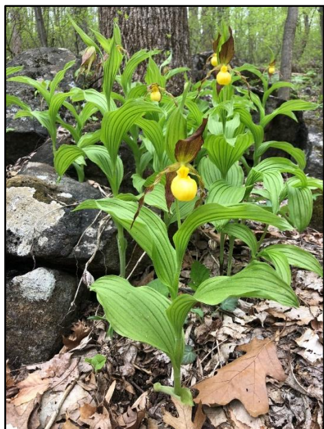
Figure 2. An example of a patch of large yellow lady's-slippers.

Large yellow lady's-slippers are quite striking with their lime green foliage and lemon-yellow flowers (Figure 2). They can occur as a single plant or form clonal patches that give rise to multiple stems (Deller 2005). In Pennsylvania, large yellow lady's-slipper emerges in the spring before full canopy leaf-out. Each stem has one or more alternately attached leaves. From data collected during this study, we found leaf number ranged from a single leaf of a new seedling to up to six leaves. Typically, plants with less than four leaves did not flower. Of the plants that do flower, a single flower was most common, although, we did discover a few double blooms. Large yellow lady's-slipper's pouch-like flowers bloom in May and June for approximately two weeks. The sepals and petals are variable, ranging from light green to purple. The petals are sometimes spirally twisted or flat and are strongly descending. Large yellow lady's-slippers are known to be quite variable especially the coloration of the sepals and petals (Flora of North America, Rhoads and Block 2007).