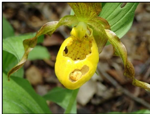
Figure 7. Examples of insect damage to the leaves and flower of large yellow lady's-slipper.